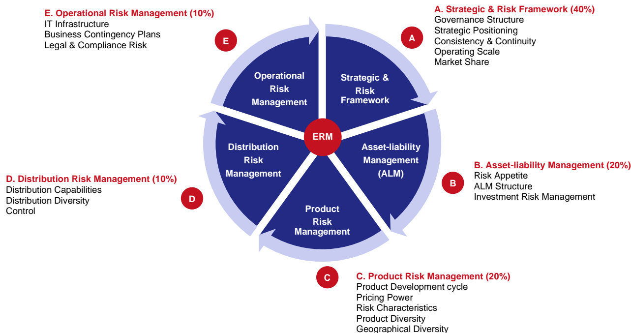
Exhibit 11: Our ERM Review

For each of the factors, the sub-factors are evaluated on a holistic basis to arrive at a score out of 7. For example, when we review a firm’s distribution risk management, we examine its distribution capabilities, diversity and control and assign an overall score out of 7. We do not assign specific weightings to the sub-factors, as their importance may vary from insurer to insurer.