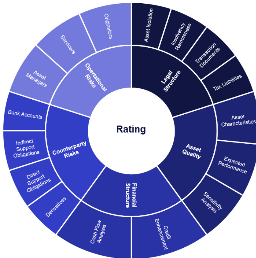
Exhibit 1 Rating Components

Exhibit 1 shows the key analytical components and sub-factors CSPI Ratings considers when assigning and monitoring credit ratings for structured finance transactions.